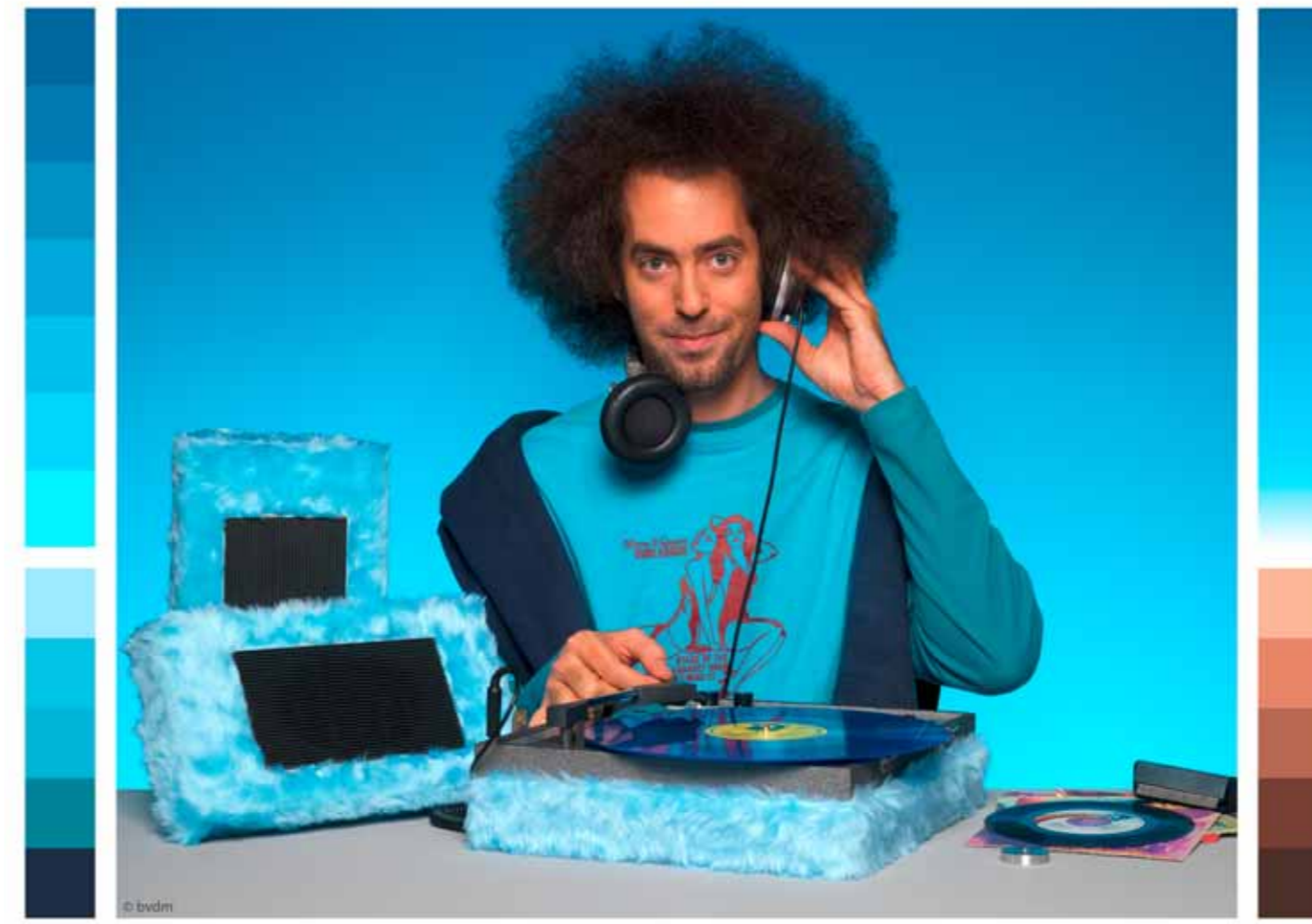
Druckbedingung: PSO Coated NP beta iso12647 (ECI) Testserie nichtperiodische Raster (bvdm/ECI/Fogra) | roman16 bvdm-Referenzbilder