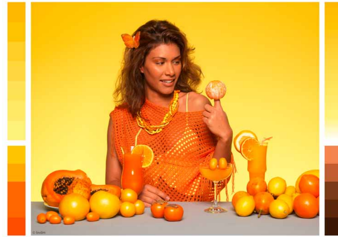
Printing condition: PSO Coated NP beta iso12647 (ECI) Test series non-periodic screens (bvdm/ECI/Fogra) | roman16 bvdm Reference Images